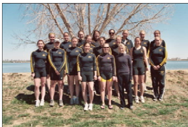
THE WOMEN'S TEAM STANDS ON THE SHORE OF UNION RESERVOIR AFTER A MORNING OF RACING AND A BBQ HOSTED BY THE FRIENDS OF COLORADO CREW.

For those of you interested in attending Boulder Sprints next year the team has tentatively scheduled the race for April 12 th or 19 th . The date will be finalized and published in our next newsletter at the beginning of next season.