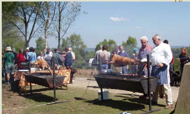
The Friends of Colorado Crew Organization will host Clay Pigeon Shooting Challenge and Pig Roast Fundraiser.

The Clay Shooting Contest is a great way to spend a weekend day whether you're Continued pg 6