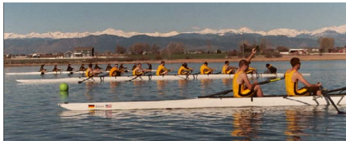
MEN AND WOMEN TAKE THEIR POINT AT BOULDER SPRINTS

April 14 th – Friends of Colorado Crew hosted a BBQ for parents, alumni, supporters and rowers after Colorado Crew's annual Boulder Sprints Regatta. Friends of Colorado Crew and alumni helped to cook 40 hamburgers and 30 hotdogs for all those that came to Union Reservoir in Longmont. Colorado Crew conducted a scrimmage and completed at least four 2K race pieces. The scrimmage was great preparation for their final regatta in Sacramento. Boulder Sprints was suppose to feature a duals race between Colorado Crew and the University of Oklahoma City, but the prediction of