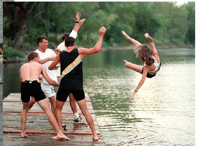
CAN NAME THIS COXSWAIN? DES MOINES, IOWA